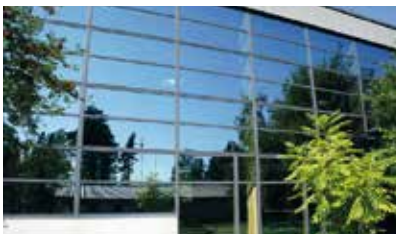
Martinlaakso tennis centre, Espoo