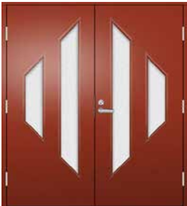
117 Doors as double doors