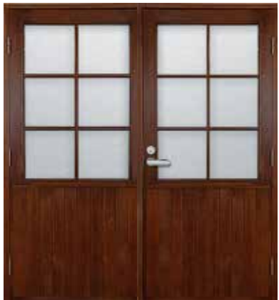
EPO Doors as double doors

A good choice for your home is a front door with an extension: except that it is practical it also