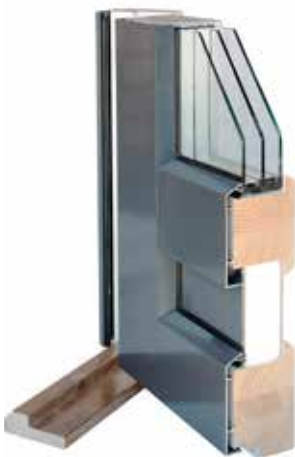
Balcony door SEPO 80 mm