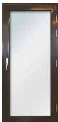
EPO-A Fully-glazed door