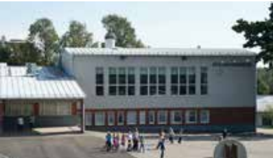
Mattliden IB World School, Espoo