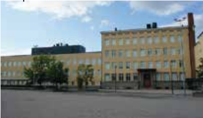
Nekalan koulu (Nekala school), Tampere