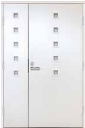
407 Door with extension