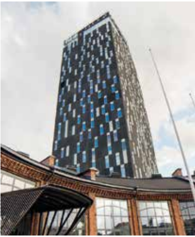
Hotel Torni, Tampere, Finland