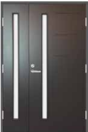
401 Door with extension

looks impressive. Extensions installed in the door opening can be fixed or opening.