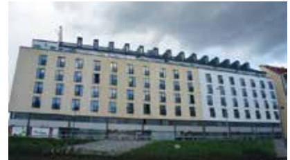
HOAS (student housing foundation), Helsinki