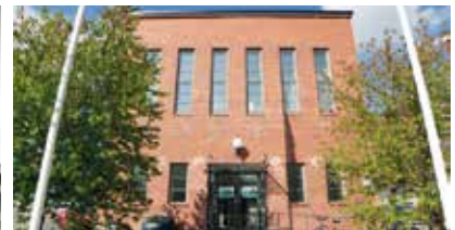
Tampereen Sähkölaitos (power plant), Tampere