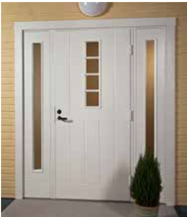
114 Door with extensions

Our range includes ready-made extensions that can be installed next to exterior doors.