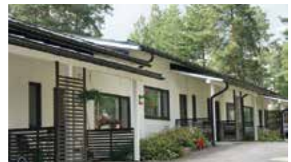
Retirement home, Kangasniemi