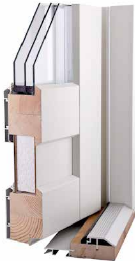
Balcony door EPO-A 80 mm