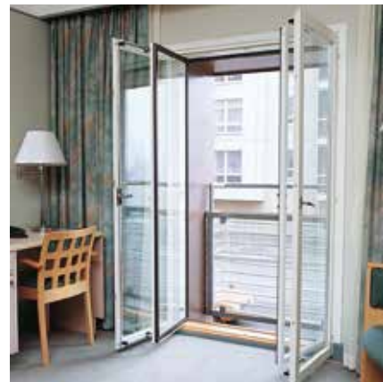
IOSA/BRIOSIA French doors