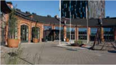
Veturitalit, Hotel Torni, Tampere