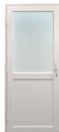
EPO-A 39 DB