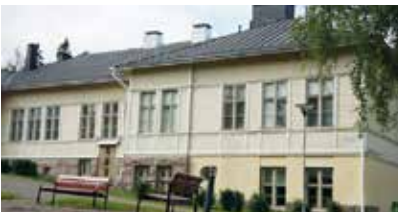
Perttula Special Vocational College, Hämeenlinna