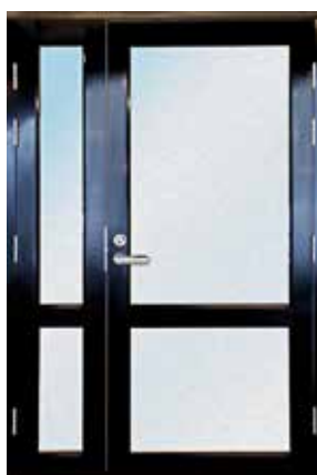
EPO-A Double door