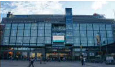
Shopping Centre Kamppi, Helsinki