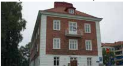
Koukkuniemi administrative building, Tampere