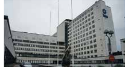
Tampere University Hospital, Tampere