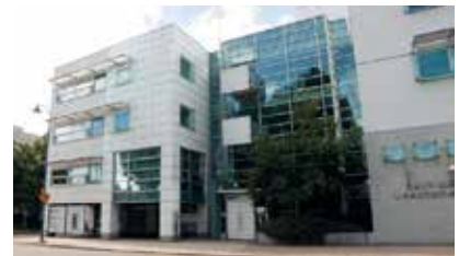
Virastotalo (public office building), Kotka