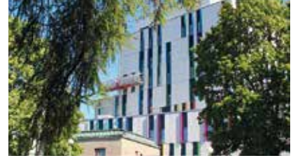
Uusi Lastensairaala, Helsinki