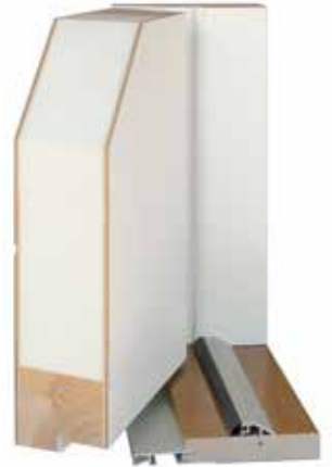
Thermal exterior door 90 mm

Weatherproof HDF board, aluminium stiffener and support veneer on both sides. Double-frame structure and EPS insulation. A wear-resistant aluminium top strip on the threshold and a handy snap-in gap in the threshold front strip for attaching the threshold plate. The 90 mm thermal door structure is also available as soundproof and fireproof structures.