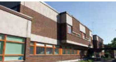
Meri-Porin yhtenäiskoulu (primary school), Pori