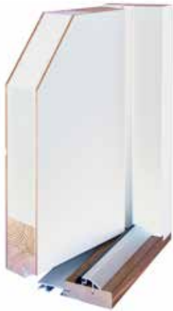
Thermal exterior door 70mm