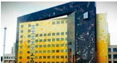
The Staraya Derevnya Restoration and Storage Centre, St. Petersburg, Russia