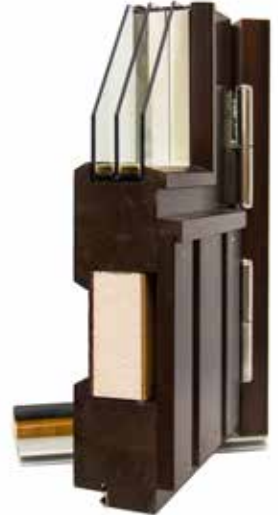
Balcony door EPO 70 mm

The wooden frame structure made of finger-jointed laminas by gluing is the strongest on the market. The panel is surface treated before assembly. 3K glazing and EPS insulation. A wear-resistant aluminium top strip on the threshold and a handy snap-in gap in the threshold front strip for attaching the threshold plate.