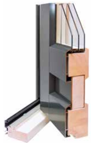
Balcony door REPO 80 mm

The market's strongest wooden frame structure made of finger-jointed laminas by gluing. The ventilated aluminium cladding is attached with durable aluminium brackets. 3K glazing and EPS insulation. The threshold water-stop and water-removal bead of durable aluminium.