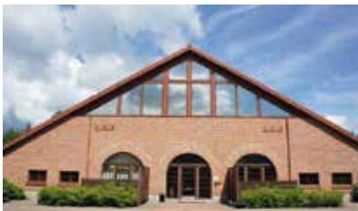
Linna Golf, Hämeenlinna